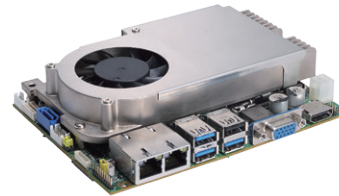
▲ Assembly View