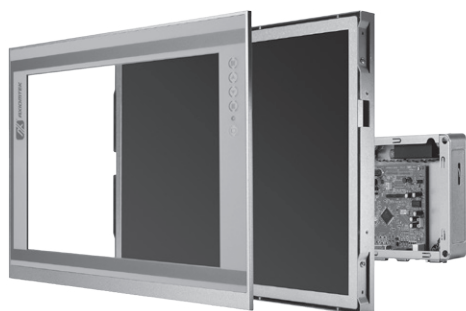
▲ Modularized design