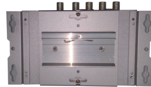
Wall mount/DIN-rail supported for various applications, without space limitation