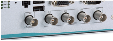
1 x audio-in + 4 x video-in BNC connector for DVR surveillance system