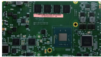
Onboard processor and system memory for great reliability and stability