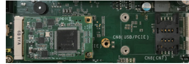
1 x PCI Express Video Capture Card 1 x PCI Express Mini Card slot + 1 x SIM Card slot