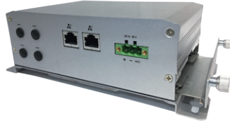
1 x swappable HDD/SSD