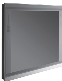
▲ Ultra-slim mechanism design